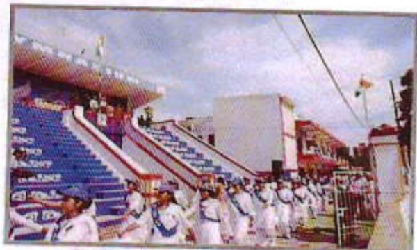
Parade by NSS Volunteers