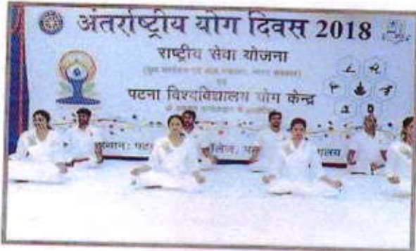
International Yoga Day at Patna Science College Campus