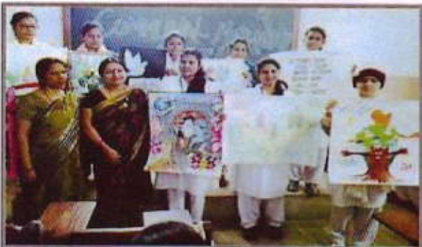
Poster Display at Patna Women's College on Communal Harmony Day