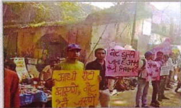
PU NSS volunteers with placards for awareness among voters