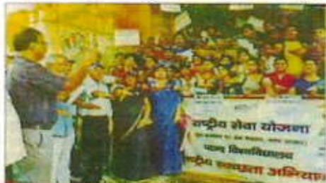
पटना हाइस परिसर में वोट जागरूकता को लेकर एक अभिव्यक्ति कार्यक्रम आयोजित किया गया।