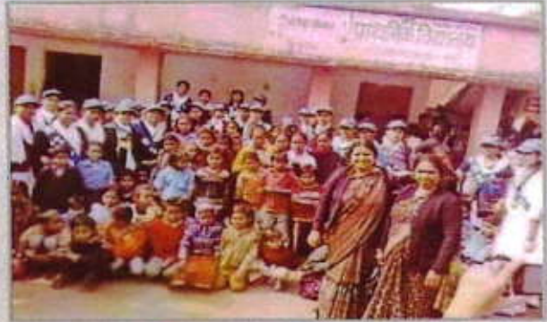
NSS Volunteers visiting Primary School