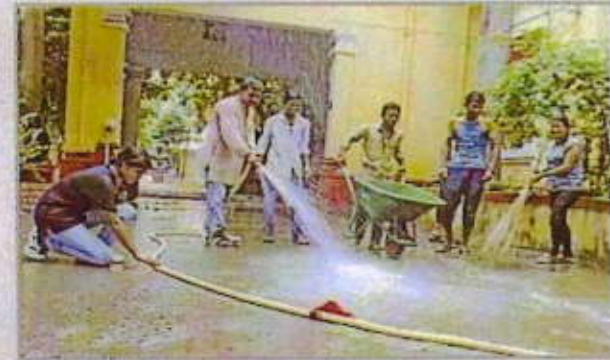
Campus cleaning activities by NSS Programme Officer and volunteer