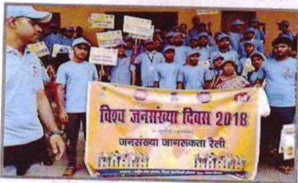
Awareness Rally on World Population Day