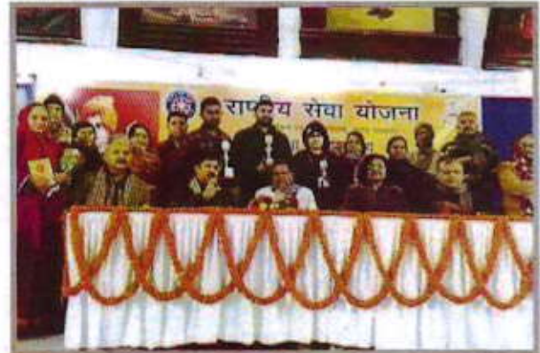
Swami Vivekanand Jayanti (National Youth Day) at Wheeler Senate House