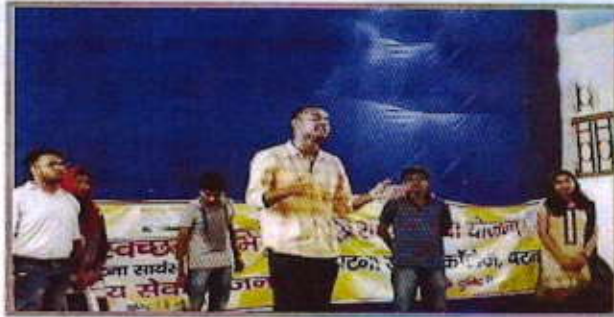
Skit on Swachchata Abhiyan