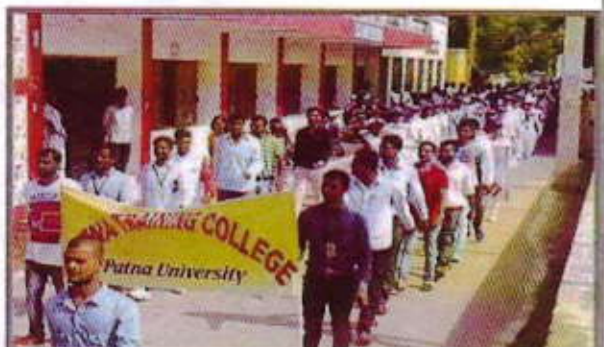
Volunteers of Patna Training College at Independence Day Programme