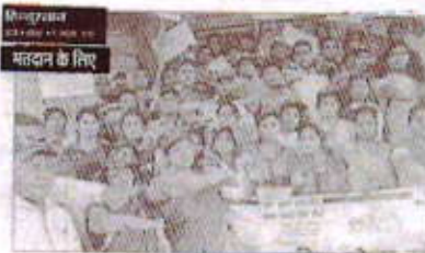
मसतान के लिए