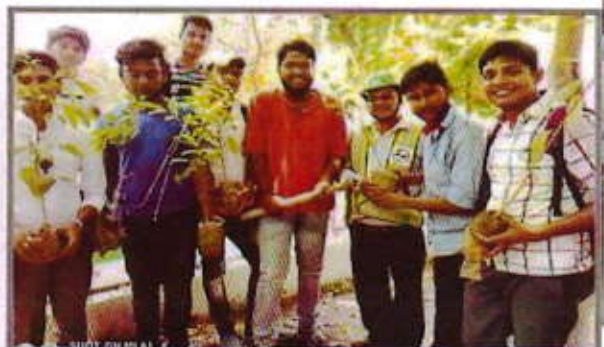
Plantation Drive at Patna College