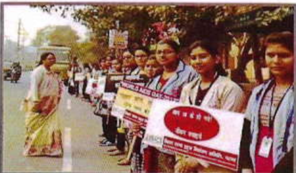
Human Chain on World AIDS Day by Magadh Mahila College