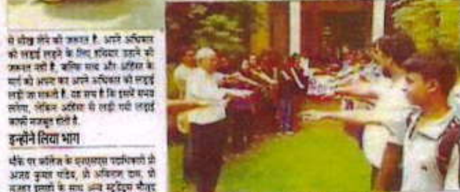
उत्तराखण्ड शिक्षा विभाग के कार्यक्रम में सहभागिता लेने वाले स्टूडेंट्स