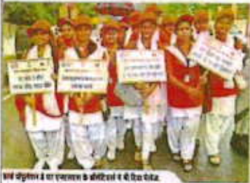
विभिन्न महाविद्यालयों के छात्रों ने शहर के मुख्य thoroughfares पर एक अभिव्यक्ति कार्यक्रम आयोजित किया।

पटना : पटना विश्वविद्यालय (पु) के विभिन्न महाविद्यालयों के छात्रों ने शनिवार को शहर के मुख्य thoroughfares पर एक अभिव्यक्ति कार्यक्रम आयोजित किया। कार्यक्रम का उद्देश्य जनसंख्या को नियंत्रित करने और जनसंख्या घटाने के लिए जागरूकता फैलाना था।