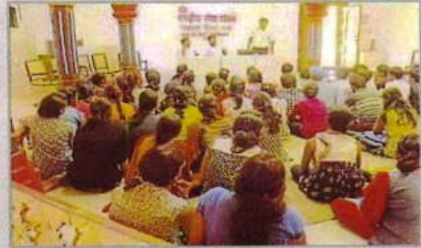
NSS Day at the College of Arts and Crafts