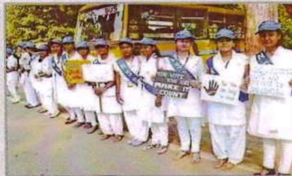
NSS volunteers forming Human Chain for Voters Awareness