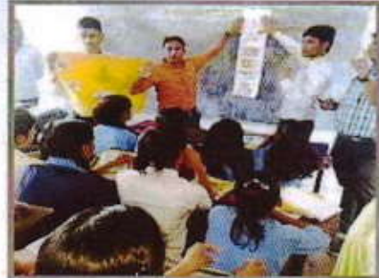
Participation in Swachch Bharat Abhiyan