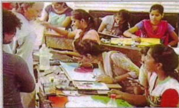
NSS Volunteers designing Posters for awareness on National Cleanliness Mission