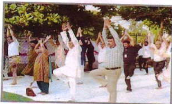
Hon'ble V.C., Registrar, Officials and Teachers at Yoga Day