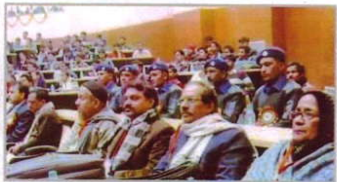
NSS Programme Officers of PU at the function