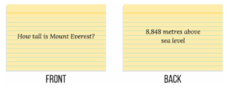
Note: Flashcards are for testing, not summarising.